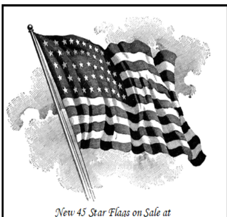
New 45 Star Flags on Sale at