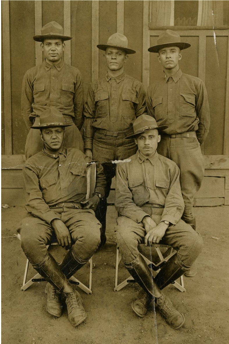
Image: Field Signal Officers at Camp Sherman