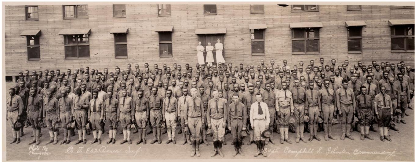
Image: 802nd Pioneer Infantry Regiment at Camp Sherman, 1918

Research Ohio's African American WWI Soldiers using one of the lesson plans below.