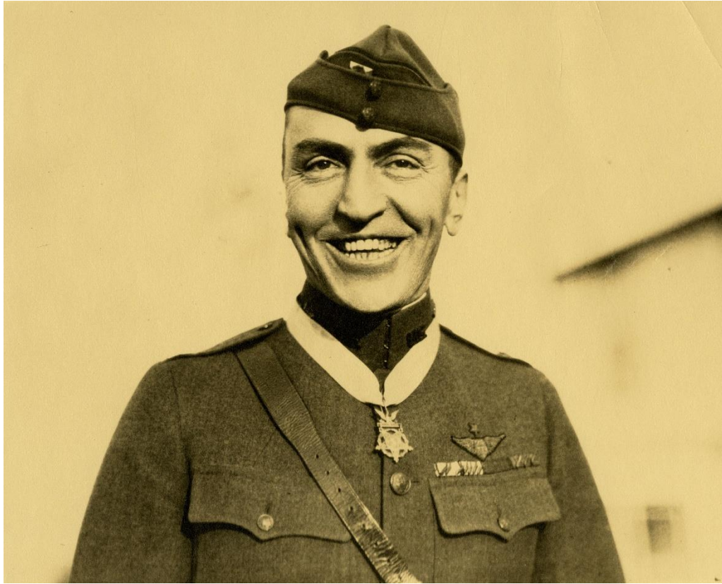
Image: Ohio native Eddie Rickenbacker, renowned World War I fighter pilot with the 94 th Aero Squadron, in his uniform, ca. 1920-1939.