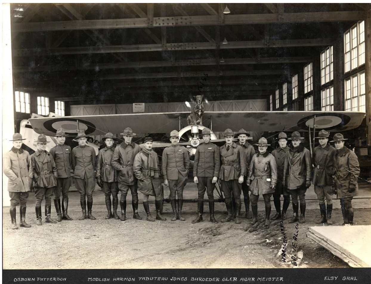
Image: 1918 Wilbur Wright Field Testing Department photograph

Source: Courtesy of the National Museum of the United States Air Force. Via Ohio Memory. http://www.ohiomemory.org/cdm/ref/collection/p267401coll36/id/23823