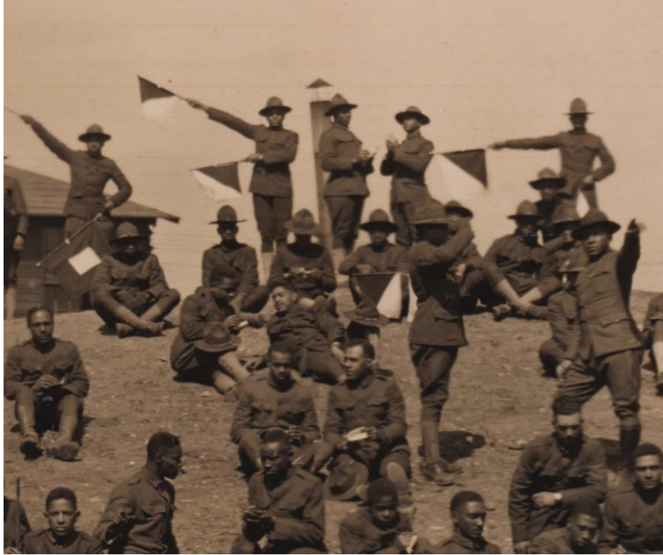
Image: Company A, 325th Field Signal Battalion photograph, March 18, 1918